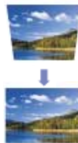
Digital Keystone Adjustment