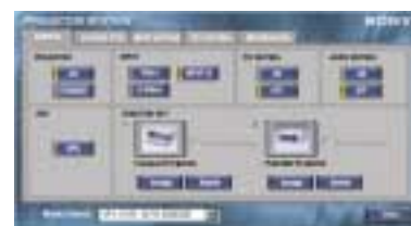
PROJECTOR STATION version 2.0